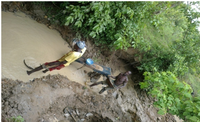
Figure 6. Polluted river water due to sand, gravel and gold mining in Luku Village

materials. In-stream mining of sand, gravel and gold in the area has led to the re-suspension of sediments in the water causing the brownish colouration of the water and this water is been consumed by the miners in the area due to lack of alternative source for drinking water (Figure 6).