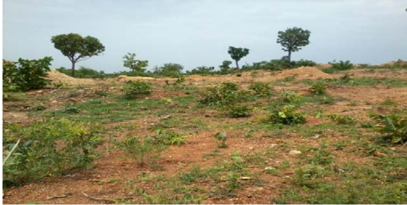
Figure 5. Destruction of vegetation due to sand and gravel mining leading to lost of natural habitats of some animals and some plants species

Mining of sand and gravel in the study area resulted in destruction of vegetation thereby destroying the natural habitats of some animals (Figure 5). Some very important plant species are also destroyed and the soil is exposed to erosion.