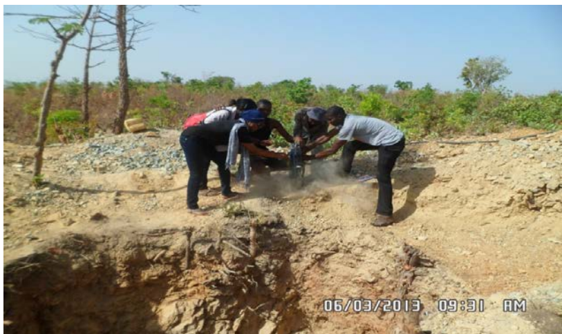
Figure 7. Dust generation due to drilling activity resulting in air pollution in Luku