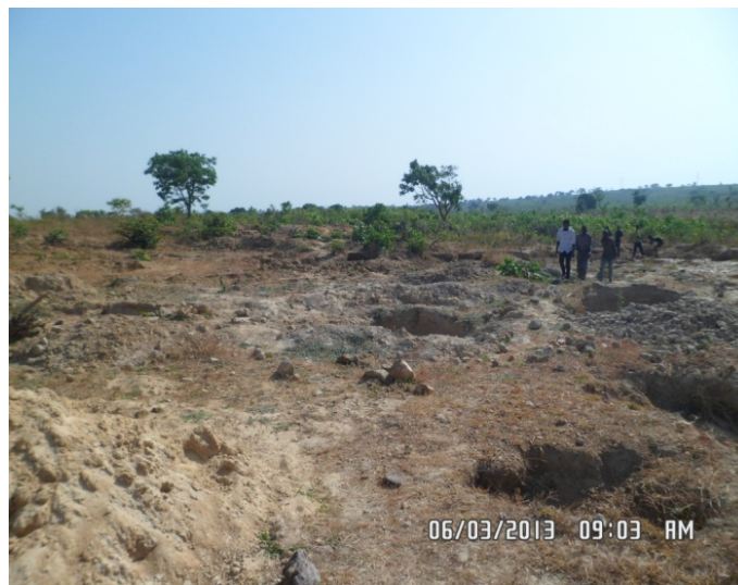
Figure 3. Pits formed from sand and gravel mining resulting in the destruction of the original landscape of the area.

(Figure 3). During the raining season these pits collect and store stagnant water and as such, serve as breeding ground for pests such as mosquitoes and other water borne insects which in turn can affect the health of the people living in and around the area.