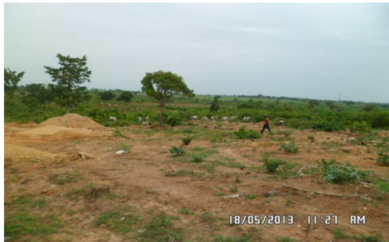
Figure 2. Loss of Vegetation due to sand and gravel mining. This leads to reduction in farming and grazing grounds in the study area