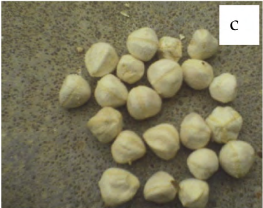
Fig. 2.2. Moringa oleifera (a) Dried pods (b) Seed kernel with husks (c) seed kernel without husk

The refined oil is clear, odourless and resists rancidity like any other botanical oil. The seed cake remaining after the oil extraction can be used as fertilizer or as flocculants to treat turbid water. The leaves are highly nutritious, being a significant source of beta-carotene, Vitamin C, protein, iron and potassium; it is consumed mostly among the Hausas in Northern Nigeria. In addition to being used fresh as a substitute for spinach, the leaves are commonly dried and processed into powder and used in soups and sauces.