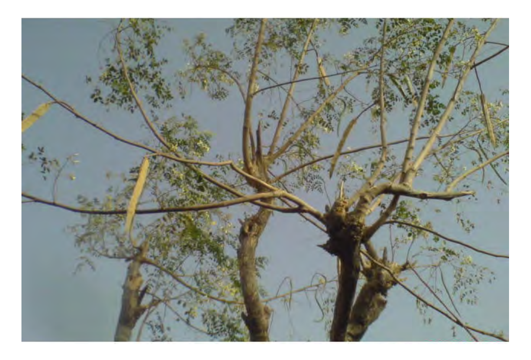
Fig. 2.1. Moringa oleifera tree

The Moringa tree grows mainly in semi-arid tropical and subtropical areas, but grows best in dry sandy soil; it tolerates poor soil, including coastal areas. It is a fast-growing, drought-resistant tree that is native to the southern foothills of the Himalayas, and possibly Africa and the Middle East. The tree has its origin from the Southern Indian State of Tamilnadu. Today, it is widely cultivated in Africa, Central and South America, Sri Lanka, India, Mexico, Malaysia and the Philippines. It grows up to 4m in height and develops to flowering and fruiting within one year of its cultivation. Moringa oleifera is considered as one of the world's most useful trees, this is because almost every part of the tree can be used for food, or has some other beneficial property. Hence it is commonly called the 'Wonder Tree'. In the tropics, it is used as foliage for livestock. The immature green pods, called "drumsticks" are probably the most valued and widely used part of the tree. They are commonly consumed in India, and are generally prepared in a similar fashion to green beans and have a slight asparagus taste (Rajangam et al , 2000).